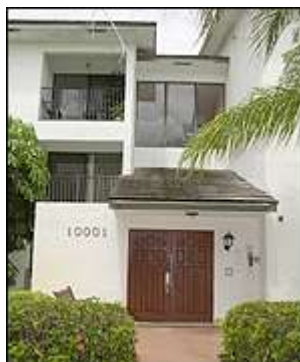
Atta lived in Coral Springs

Their neighbour's wife and children stayed longer, moving out just days before the terror attacks.