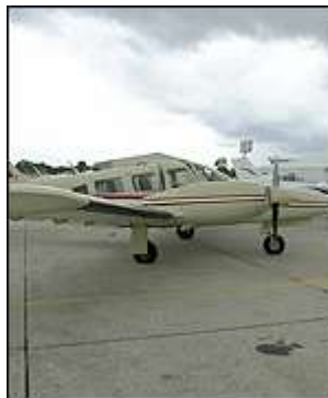
The suspects trained in a twin engine plane

The pair lived in Coral Springs, and held passports from the United Arab Emirates.