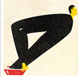
Room for Debate: Is Fiction Just for Fun?