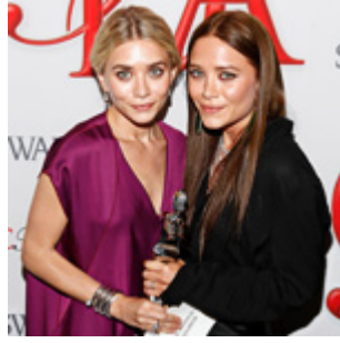
Fashion Awards, on Speed Dial