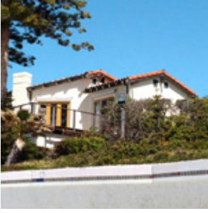
The Candidate Next Door