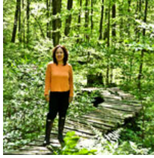
Finding Flavor in the Weeds