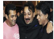
Salman Khan hugs Shah Rukh Khan