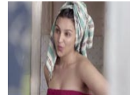
New song: 'Tere Mere Beech Mein' fr..