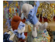
'The Smurfs 2' A Rescue Mission!..