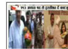
Katju, Jaitley at war over Modi