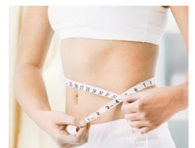
7 Day flat belly diet plan