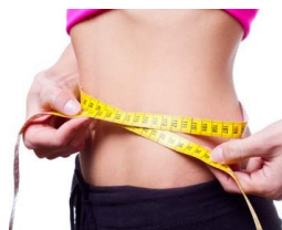
5 Steps to a flat tummy in 7 days