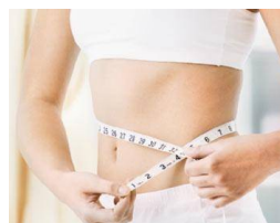
7 Day flat belly diet plan