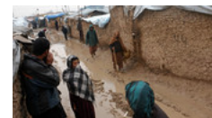
Afghans Flee Homes as U.S. Pulls Back