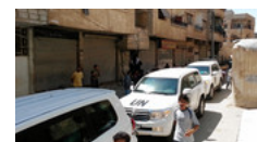
Syrian Regime Blocks