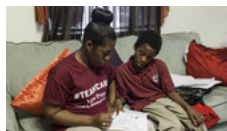
Inside the Nation's Biggest Experiment in School Choice