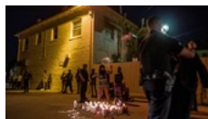
Cities Use Sticks, Carrots to Rein In Gangs