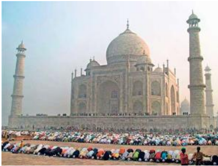
People offer namaz at Taj Mahal.

NEW DELHI: They wore black ribbons, carried placards of peace, sent out emails and SMSes reiterating harmony, and put up banners saluting those who died in the 26/11 terrorist attack. From Chennai's Thousand Lights Mosque to Delhi's Jama Masjid, from Khwaza Banda Nawaz dargah in Gulbarga, to the mosques of Mumbai — Bakr-Eid celebrations were subdued, in a symbolic declaration of Muslim protest against terrorism.