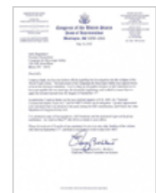
A letter from Congressman Sherwood L. Boehlert